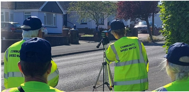
Paignton CSW & PCSO working together

"For any new groups setting up who are unsure, just do it! It's great fun (we probably have too much fun!), and we have built real friendships in the group. We feel part of the community and have many drivers who give us a thumbs-up or wave. A couple of the local businesses have gotten involved too and we also have people stopping to ask if we can do a session in a certain part of the village where they have noticed an issue with speeding. Yes, we also receive some abuse, but this is outweighed by the number of positive drivers who feel it is necessary, and we know we are helping our community be a safer place for all."